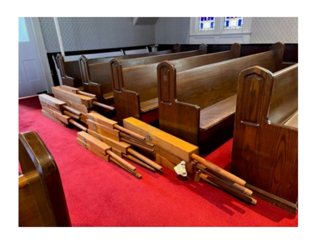
Pipes side view