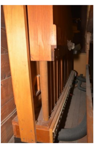
Pipes with pedal chest