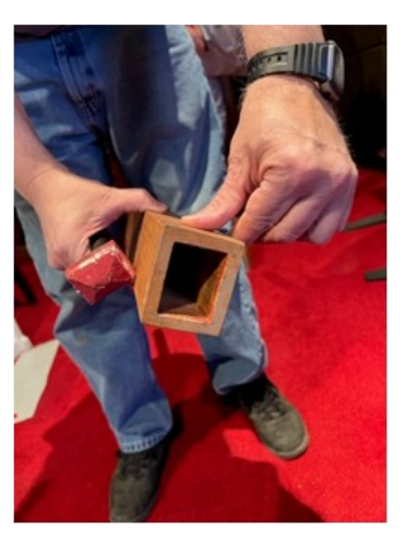
Felt lining on stop