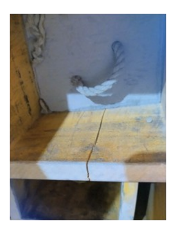
Crack in pipe